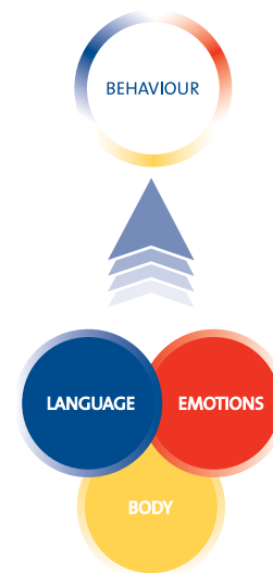
WAY OF BEING

Ontological Coaching is an extraordinarily powerful methodology for generating real change at the individual, team and organisational level. It is highly effective because it is based on a new practical understanding of the power of language, moods and conversations for sustainable behavioural and cultural change.